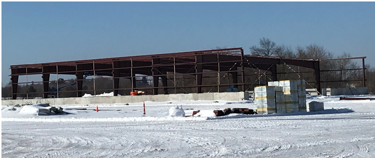
Unit E—Cold Storage Framing is Ongoing