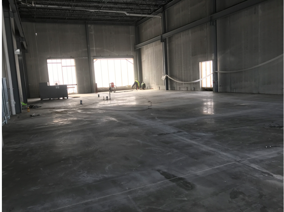
Unit B Fabrication Shop Floor Poured