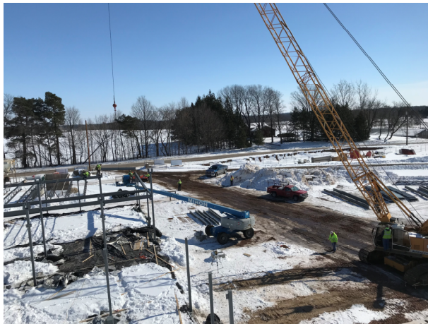
Waupaca County Highway Commissioner Setting Steel Beam in Office