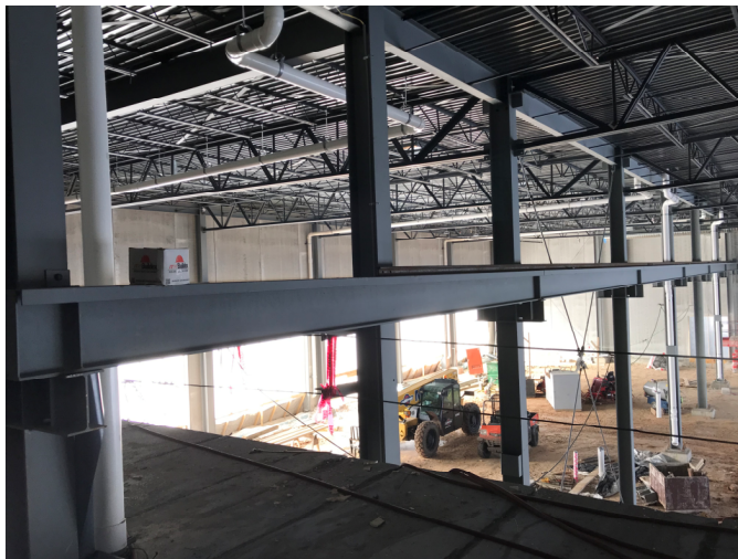
Unit B Precast, Steel Framing and Roofing Complete