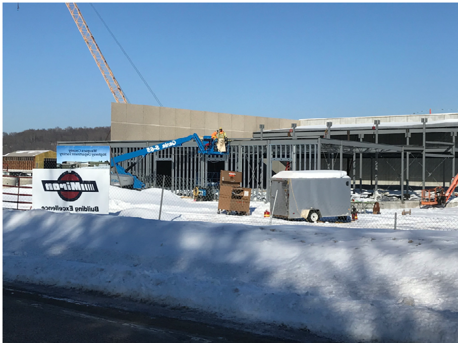
Unit A Office Area Structural Steel Framing Complete. Exterior Steel Framing Ongoing