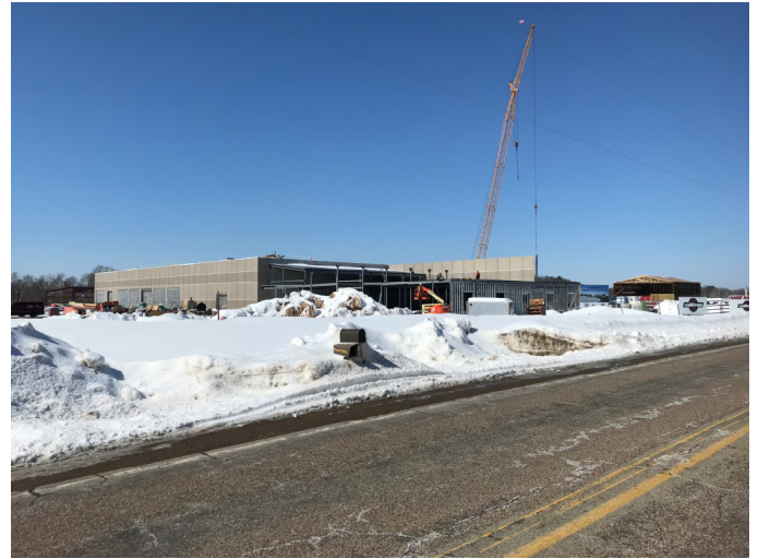
Southeast View from County A