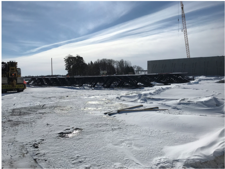
Unit C Steel Roof Joists On Site