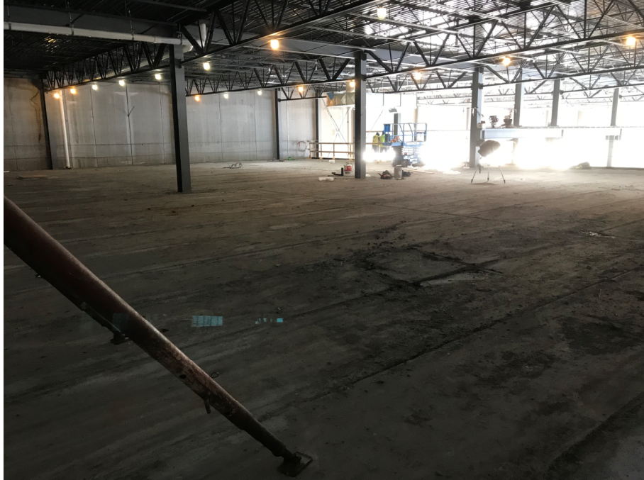
Unit B—Mezzanine Getting Ready to Pour Concrete