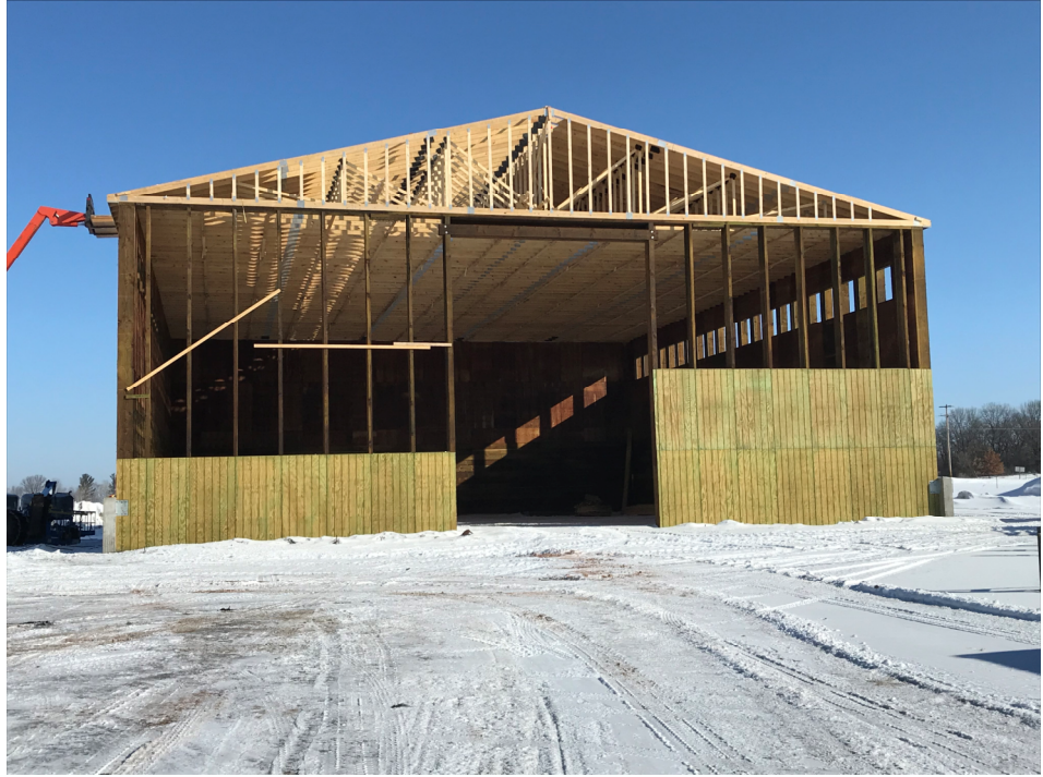
County Salt Shed Roof Sheathing Ongoing