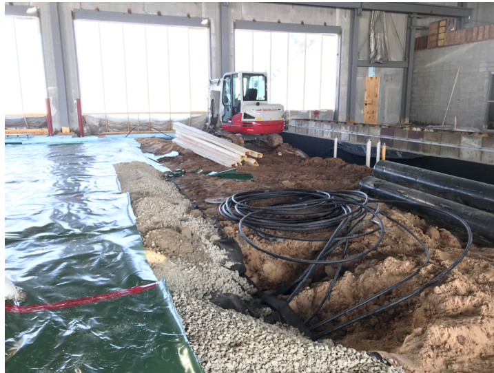
Unit B—Repair Shop Service Trench Wall Poured, Electrical Rough In Underground and Temporary Enclosure is in Place